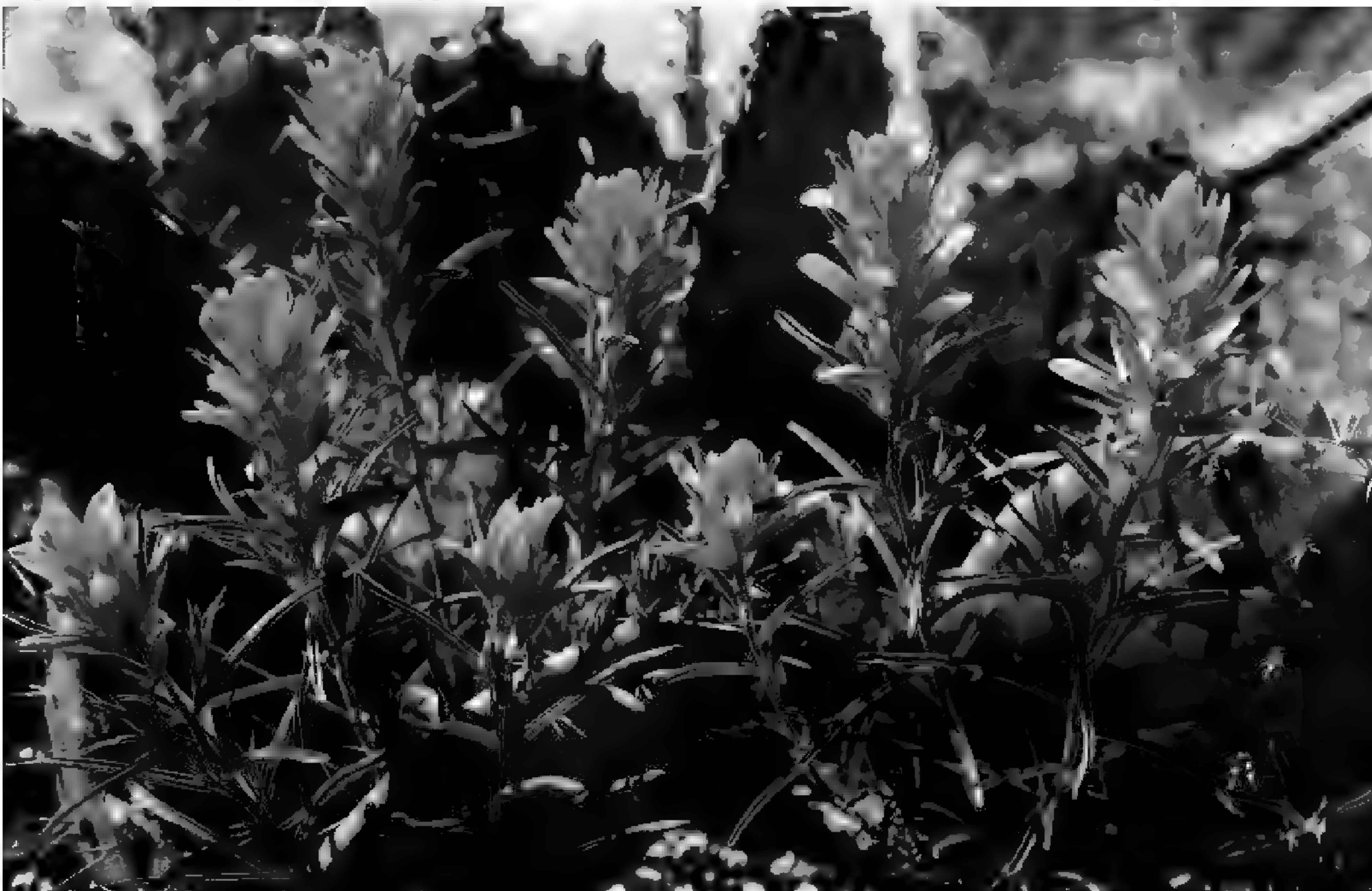
Figure 8. Castilleja genevievana . East of Sheffield, Crockett Co., Texas, 19 Apr 1997. Does the yellow color indicate shared ancestry with C. citrina ?